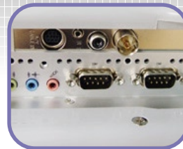
TV tuner or Video Capture