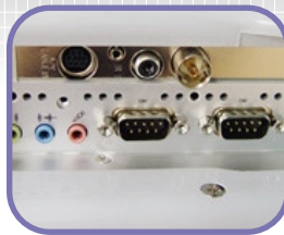
TV tuner or Video Capture