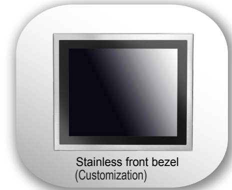
Stainless front bezel (Customization)