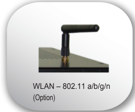
WLAN – 802.11 a/b/g/n (Option)